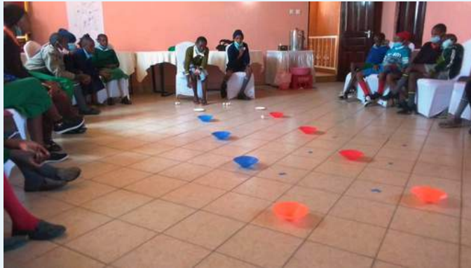
Causes and triggers class in one of the regions