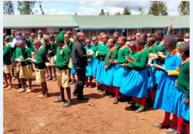
Outreach program in Nyeri

In one instance, we had to give an extra loaf of bread and packet of milk to a small girl who had refused to take hers because she wanted to go share with her sibling brother at home.