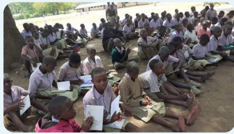
Mental health; causes and triggers lessons

We thank God for using us as vessels of help, hope and healing.