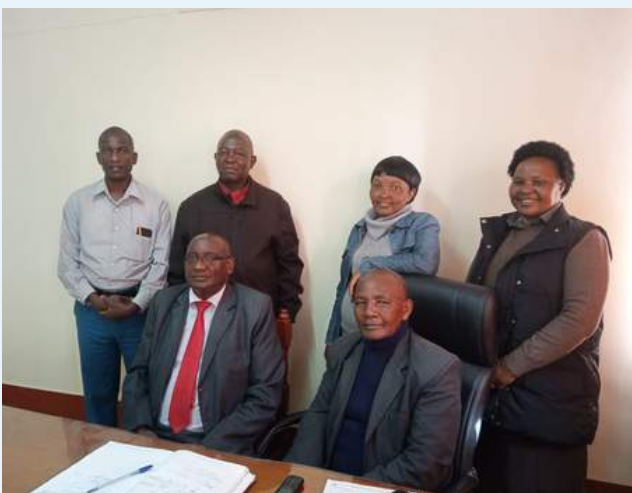
Regional Committee Members Eastern Province