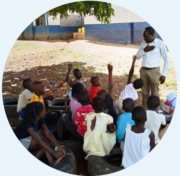
VBS in Kisumu County

We participate in this years' Kisumu County mental health day which was held at Kodiaga Maximum Prison. The day was characterized by song, dance and poems as stakeholders some among them mental health patients took to the stage to create awareness and entertain the participants during the colorful event.