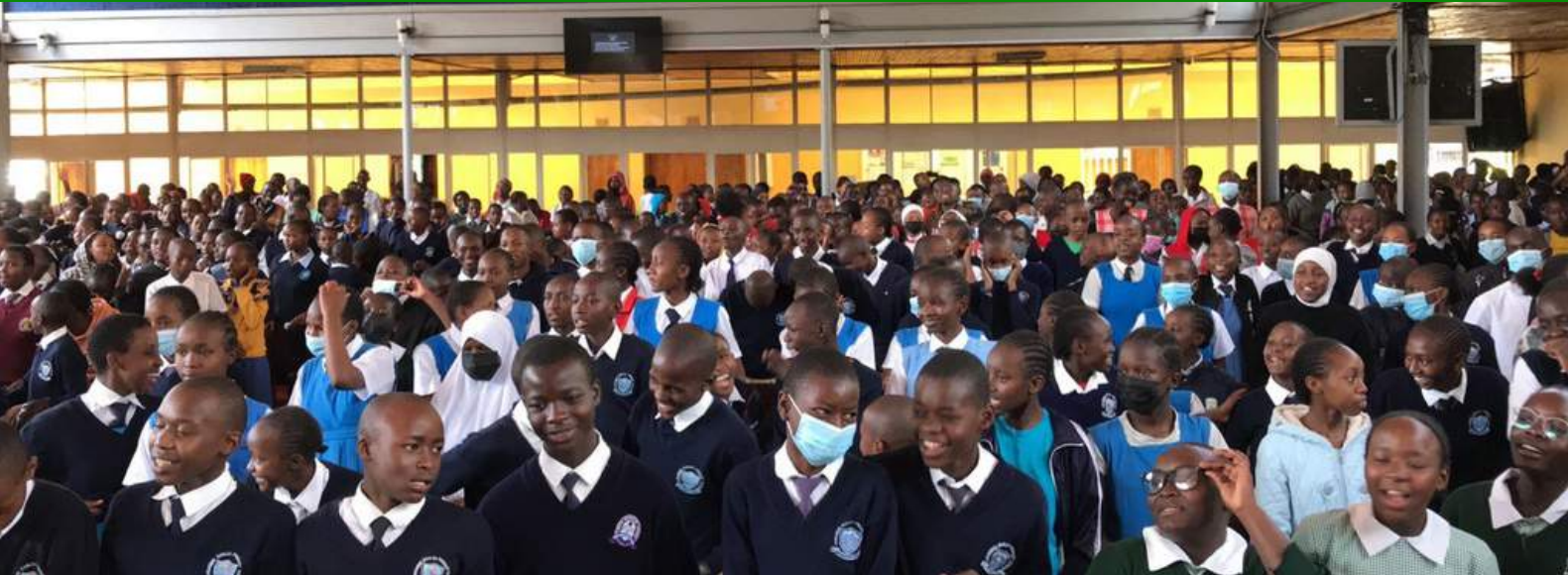
SUK Staff facilitate Class 8 Thanksgiving at ACK Cathedral Nakuru