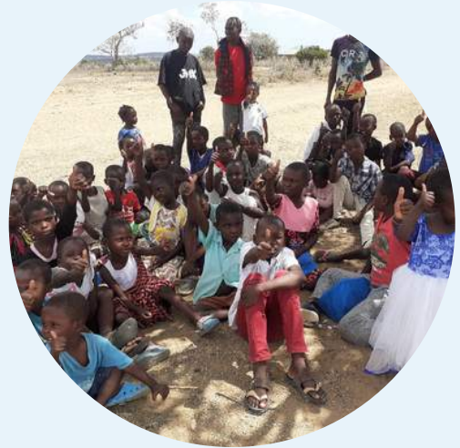
VBS in a local church