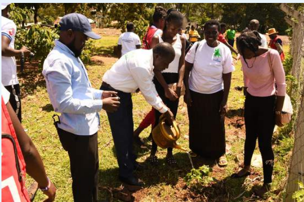
Mental health day in Kisumu 2022