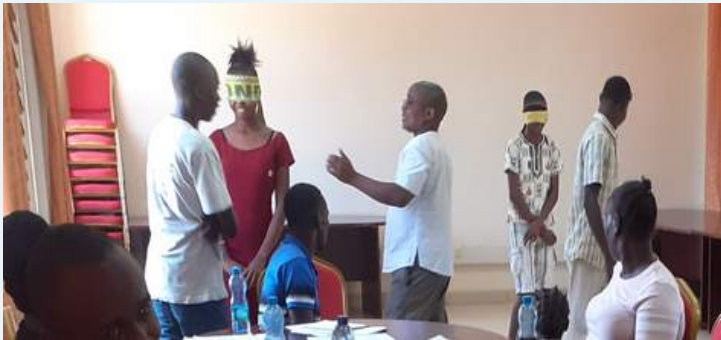
Dare To Discover Session – Witu Lamu World Vision Adp