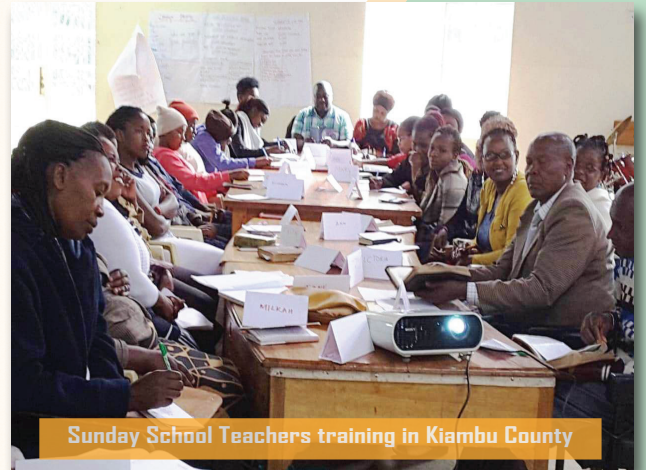
Sunday School Teachers training in Kiambu County

We thank God for opportunity to give input to Kenya Institute of Curriculum Development (KICD) and Ministry of Education in curricula development for CRE, Pertinent and Contemporary Issues, Values Based Education, Parental Empowerment and engagement, formulation of National framework of Chaplaincy policy for learning institutions as well evaluations of course materials. The Competence Based Curriculum (CBC) has great potential of developing the child into an all-rounded person and we look forward to working with other stakeholders to this end.