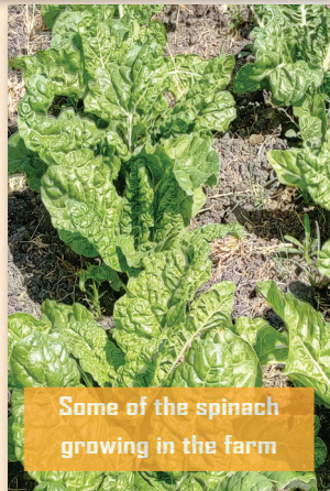
Some of the spinach growing in the farm

use of them with no apologies. It has been a joy to host the children in what they call “our camping facility”. Thanks to all those who have been part of the project.