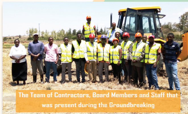
The Team of Contractors, Board Members and Staff that was present during the Groundbreaking

With the support of one of our partners, we, on 17 th September this year, embarked on yet another bold move—the groundbreaking for the camping area, amphitheater, meeting hall, open kitchen and expansion of the ablution block. The day saw National Governing Council & SUCBC Board Members, Architect, contractors and SUK Staff lay a stone of remembrance, (literally) in Thanksgiving to God for his provisions and committing the entire process to him for guidance, speed and strength. Indeed, we have experienced His faithfulness, as the ongoing work picked up progressively, and is due to be completed in December. This is just the beginning of more works to be undertaken, and we crave your continued partnership and support to see this project fully realized.