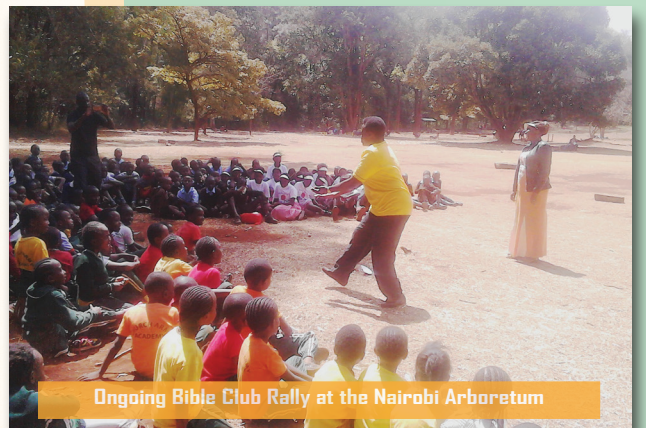
Ongoing Bible Club Rally at the Nairobi Arboretum