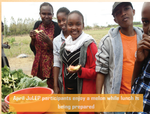
April JuLEP participants enjoy a melon while lunch is being prepared

As a way of creating sustainability, we set aside part of the land for farm use. By God’s Grace, we have been able to produce fresh onions, tomatoes, kales, danias and melons, that have both serviced the children during the Camps, as well as being sold locally. The children have experienced first-hand how these crops are grown and have made