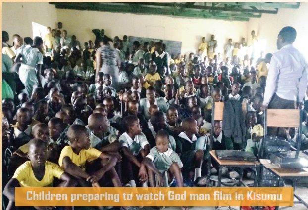
Children preparing to watch God man film in Kisumu