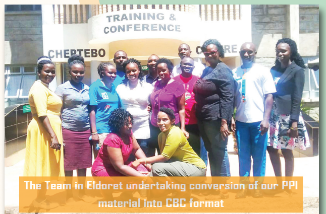
The Team in Eldoret undertaking conversion of our PPI material into CBC format