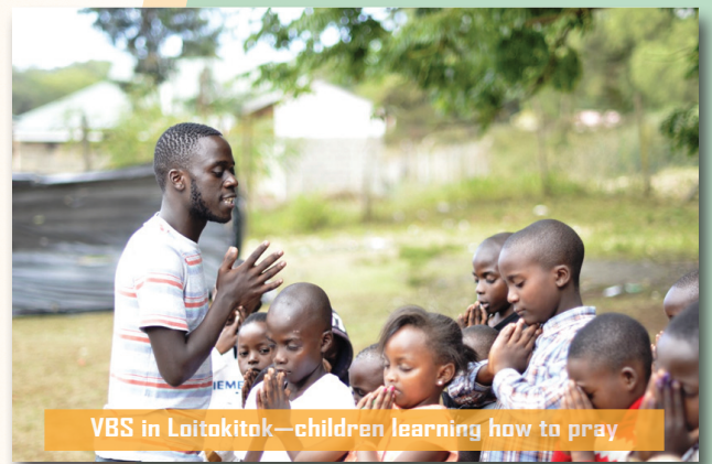
VBS in Laitokitok—children learning how to pray