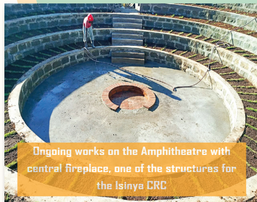
Ongoing works on the Amphitheatre with central fireplace, one of the structures for the Isinya CRC

We invite you to be part of this visionary project.