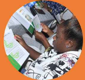
Photos from the SUK Coast Dinner at Kiembeni Open Gate Ministry and SUK Nairobi Dinner at Nairobi Baptist Church