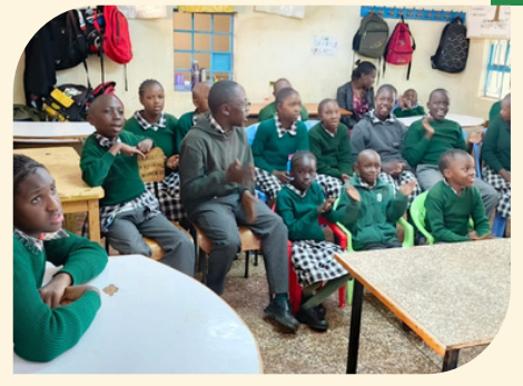
Launch of Bible Club for children with special needs in Kiambu

Over 5,000 children experienced life-changing moments through our vibrant holiday camps and rallies in August. These gatherings presented unique opportunities for fun connection and deep spiritual growth. Over 3000 children have been engaged so far in November to December and many more are still being disciplined with ongoing activities.