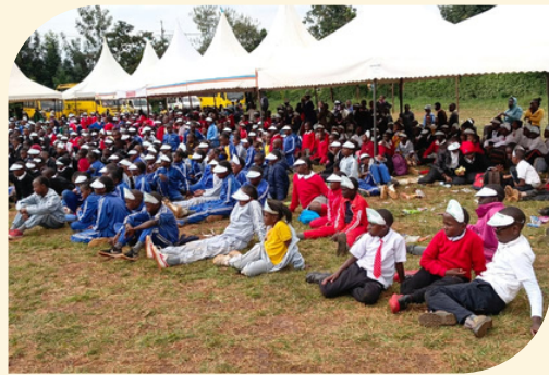
Children's Rally at Ndumberi, Kiambu

Over 5,000 children experienced life-changing moments through our vibrant holiday camps and rallies in August. These gatherings presented unique opportunities for fun connection and deep spiritual growth. Over 3000 children have been engaged so far in November to December and many more are still being disciplined with ongoing activities.