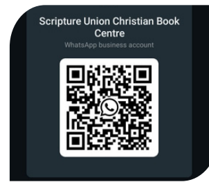
QR Code to Bookshop Catalogue