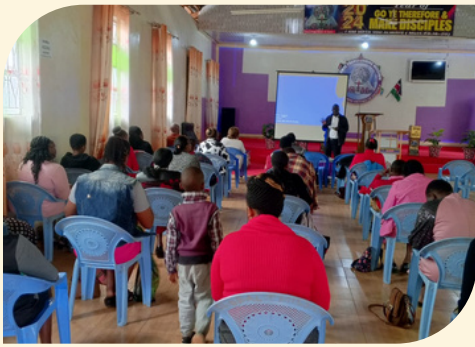
Sunday School Teachers training at Kerugoya