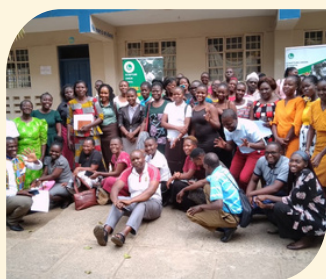
Teachers Conference in Kisumu