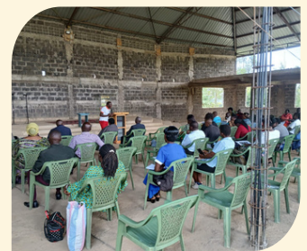
Teachers Conference at Butere Miracle Centre

But none of this would have been possible without you—our dedicated staff, volunteers, members, and partners. Your unwavering support, prayers, and contributions have been instrumental in this journey. Together, we are thriving and advancing God's kingdom work. Let us continue walking in faith, trusting Him to establish every step as we move forward. To God be all the glory!