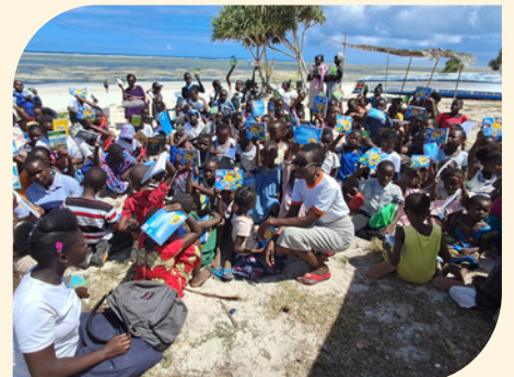
Children prayer rally at Kikambala beach, Coast

We're thrilled to celebrate the launch of Teachers' Conferences , a powerful new strategy to equip and mobilize teachers for ministry in schools! By God's grace, successful conferences have already taken place in the Lake, Central, Western, and North Rift regions reaching a total of 533 teachers. These gatherings are igniting a passion for transforming young lives through dedicated teachers. Here's to many more children being impacted for God's glory! Pray with us for establishment of Teachers Fellowships in every county and for successful conferences in 2025 targeting 1000 teachers.