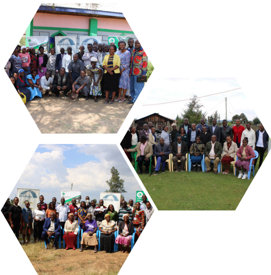
Partnership forums with 410 Bridge in Makueni, Nyandarua and Nakuru

We thank God for over 40 volunteers in Family Ministry across the country.