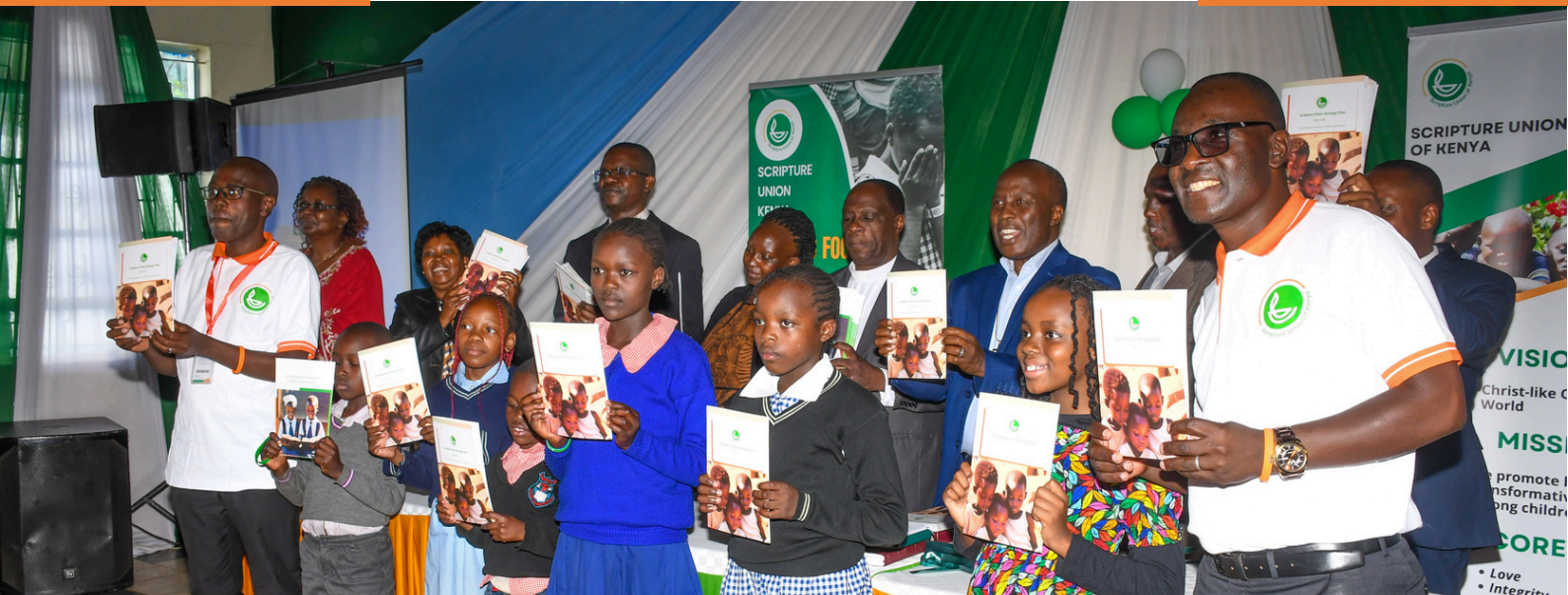
Launch of the Strategic plan 2024-2028 at Muthaiga Primary School