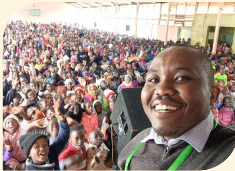
Children's Camp in AIPCA, Central