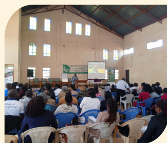
Teachers Conference at ACK St. Peters, Nyeri