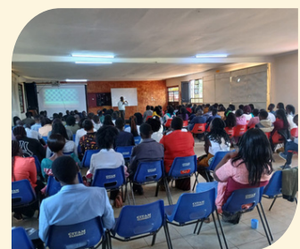
Teachers Conference at CITAM, Eldoret

We're thrilled to celebrate the launch of Teachers' Conferences , a powerful new strategy to equip and mobilize teachers for ministry in schools! By God's grace, successful conferences have already taken place in the Lake, Central, Western, and North Rift regions reaching a total of 533 teachers. These gatherings are igniting a passion for transforming young lives through dedicated teachers. Here's to many more children being impacted for God's glory! Pray with us for establishment of Teachers Fellowships in every county and for successful conferences in 2025 targeting 1000 teachers.