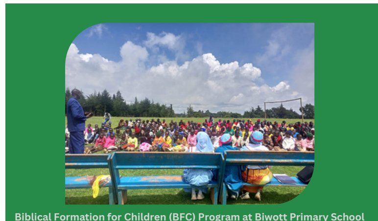
Biblical Formation for Children (BFC) Program at Biwott Primary School

Join us in prayer for resources and volunteers to reach more schools.