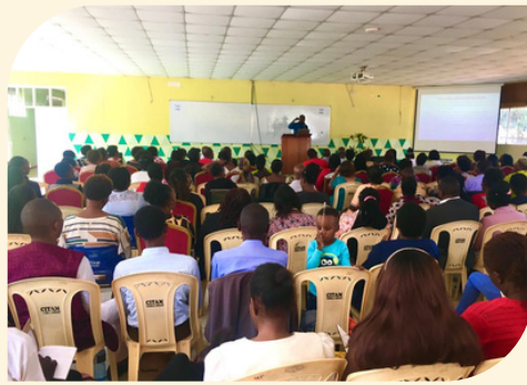
PPI facilitators training at CITAM Thika Road